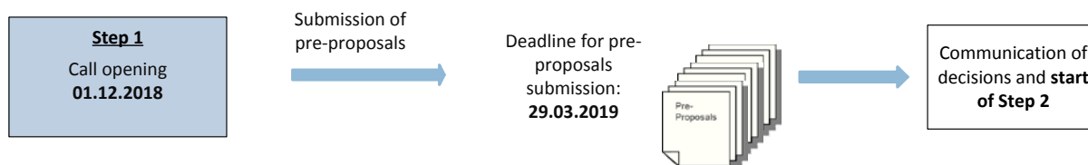
Figure 1: Step 1 process

The project coordinator of an applying consortium has to submit a pre-proposal on behalf of the consortium, providing key data on the future project proposal. The deadline for the submission of the pre-proposal is 29.03.2019, 17:00 CET .