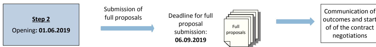
Figure 2: Step 2 process

The Annexes of this document provide the contact information of the National Programme Manager (NPM) in each participating country/region and the National Regulations. It is required that each partner in a consortium contacts his/her NPM(s) to be informed about the rules in his/her country/region prior to submission of a pre-proposal and a full proposal.